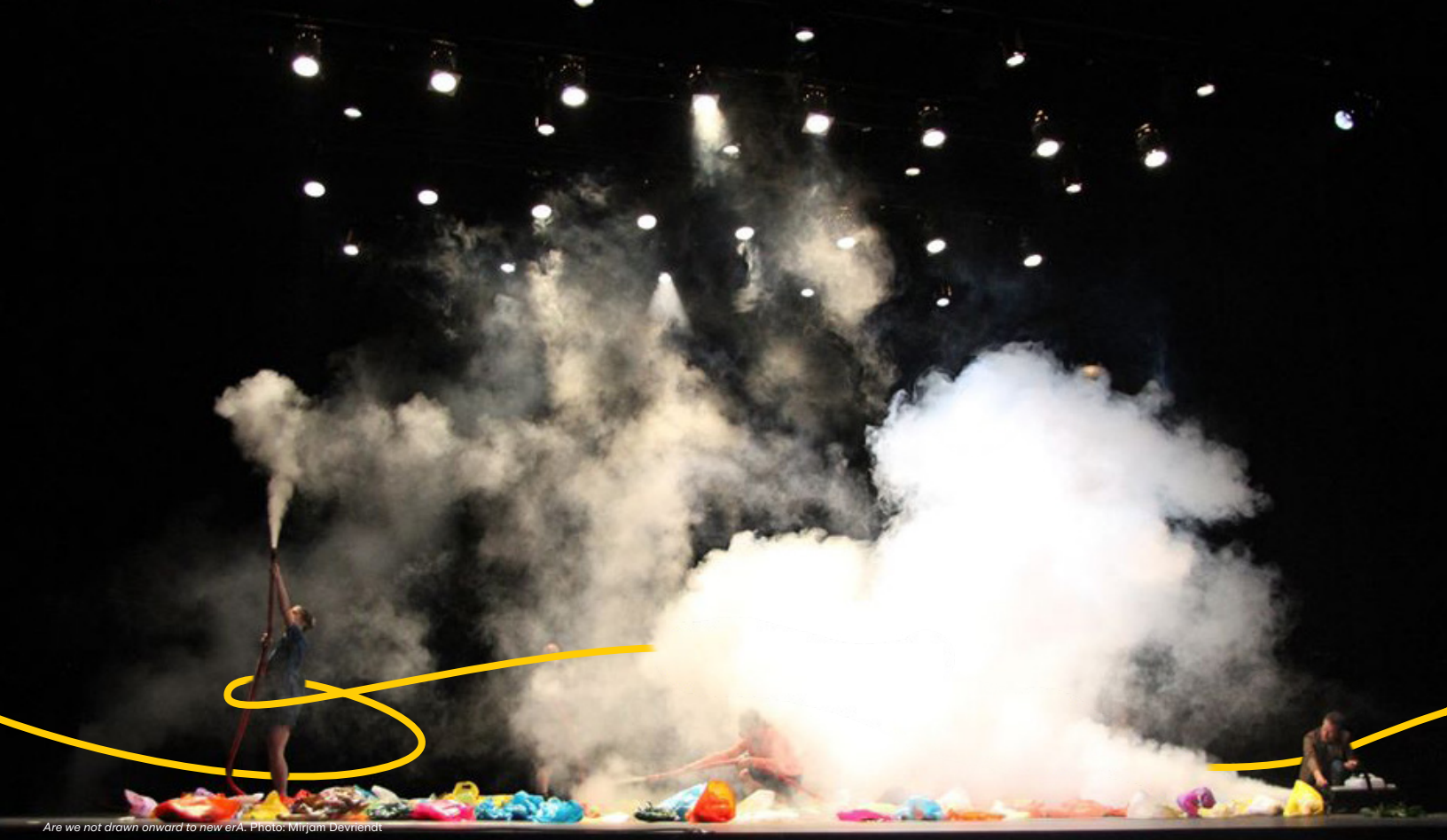
Are we not drawn onward to new erA.