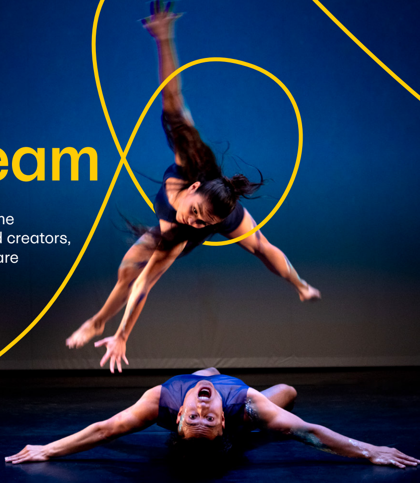
Miigis.

Canadian Stage is honoured to recognize the invaluable contributions of these artists and creators, whose hard work and boundless creativity are responsible for making our 22.23 season an outstanding success. Thank you.