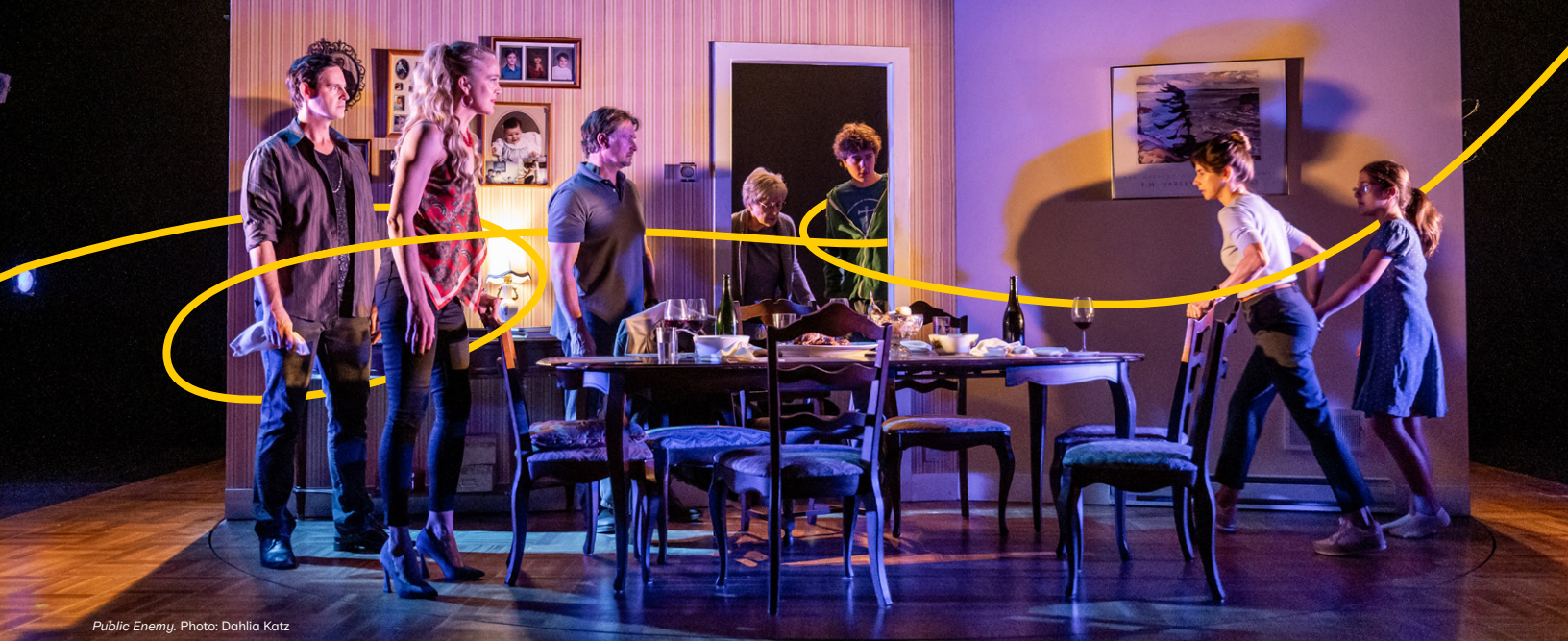
Public Enemy