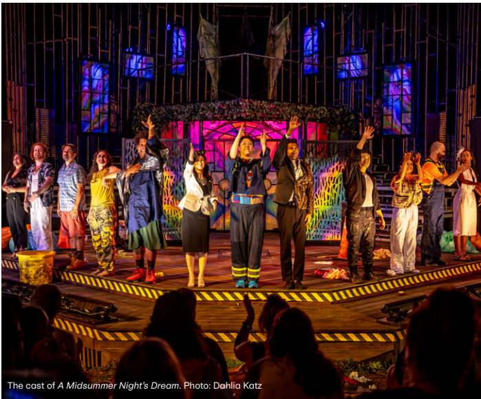
The cast of A Midsummer Night's Dream .