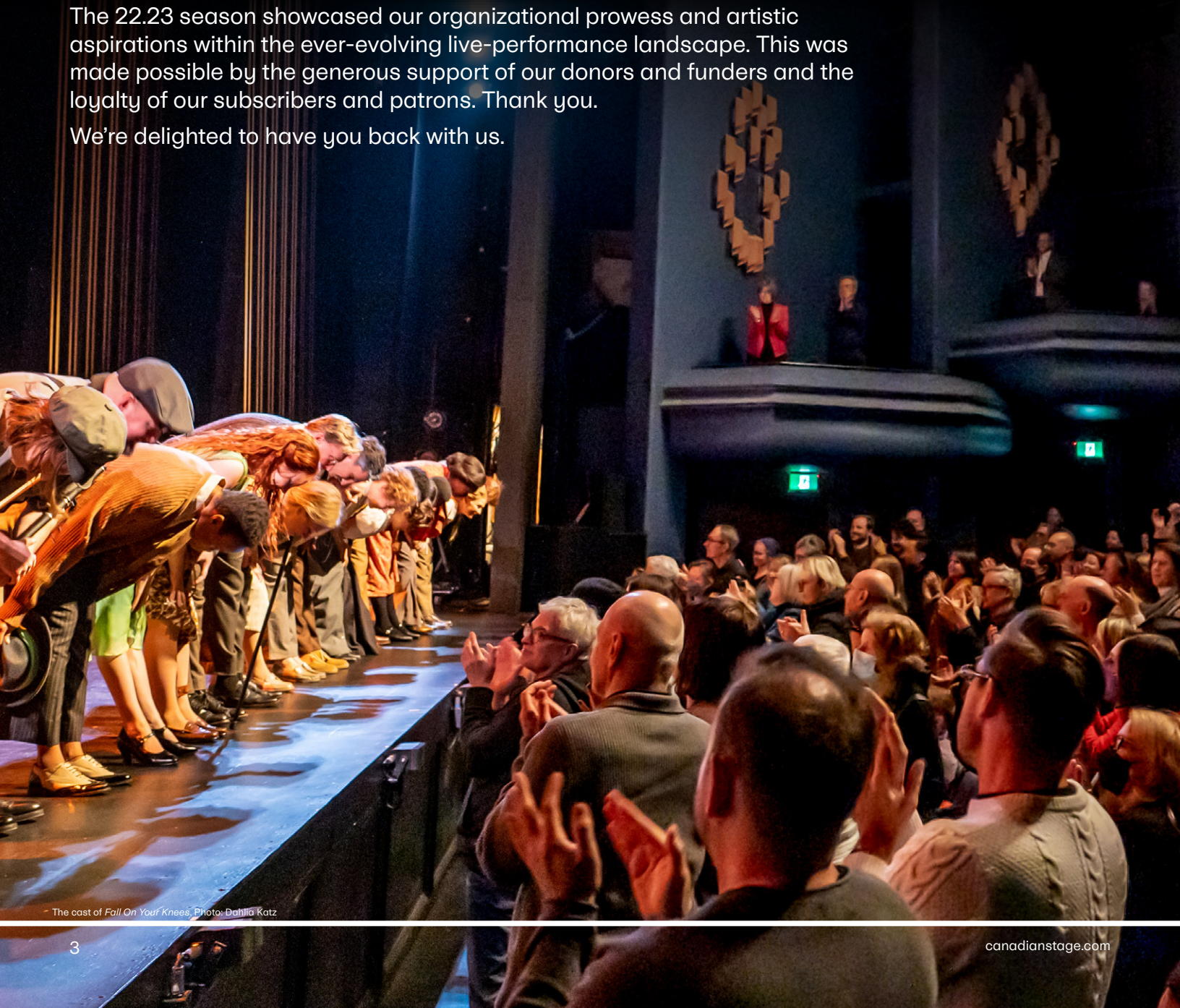
The cast of Fall On Your Knees .

We're delighted to have you back with us.