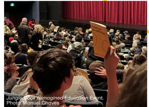
Jungle Book reimagined Education Event.

Here's a glimpse of our ongoing initiatives and projects since May 2023: